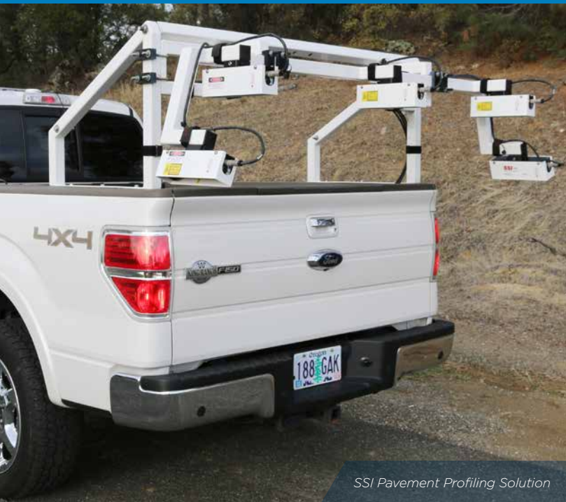
SSI Pavement Profiling Solution

A long term partner of LMI, SSI (Surface Systems & Instruments, Inc.) is a systems integrator that manufactures test equipment for measuring various surface characteristics of roads, bridges, runways and commercial floors. 800.662.5656 (US only) smoothroad.com